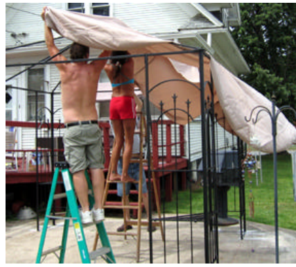
...top cover over the frame and ..