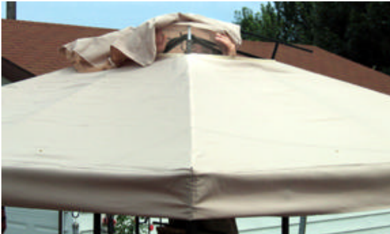
LEFT: Over the primary fabric 'roof', another canopy affair is fitted with a hot air escape between the two.