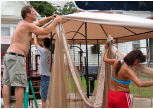
Two ladders were needed to stretch the..