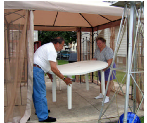
RIGHT: Now we're ready to move in! We won't need our umbrella over that table now!