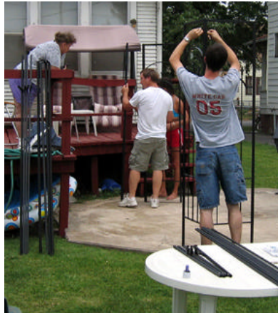
Each corner is composed of two pieces to create a very sturdy framework.