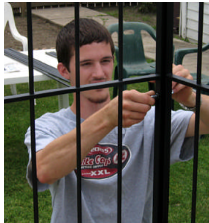
Chad was a great help and really pitched in, helping to complete the project.