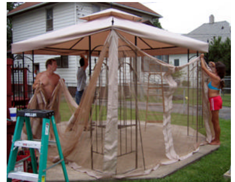
RIGHT: It's shaping up nicely and is nearly complete.