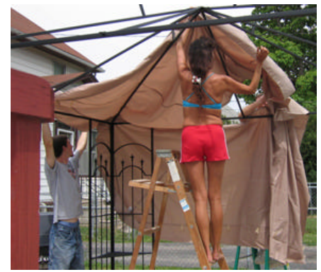
attach it neatly to the frame.