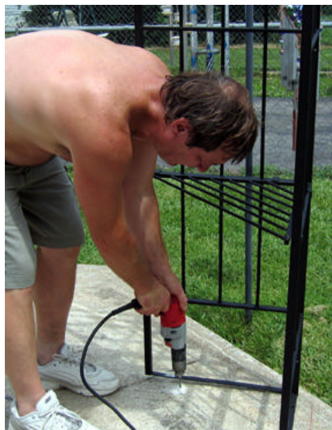
Each corner is bolted down into the concrete for a sturdy framework.