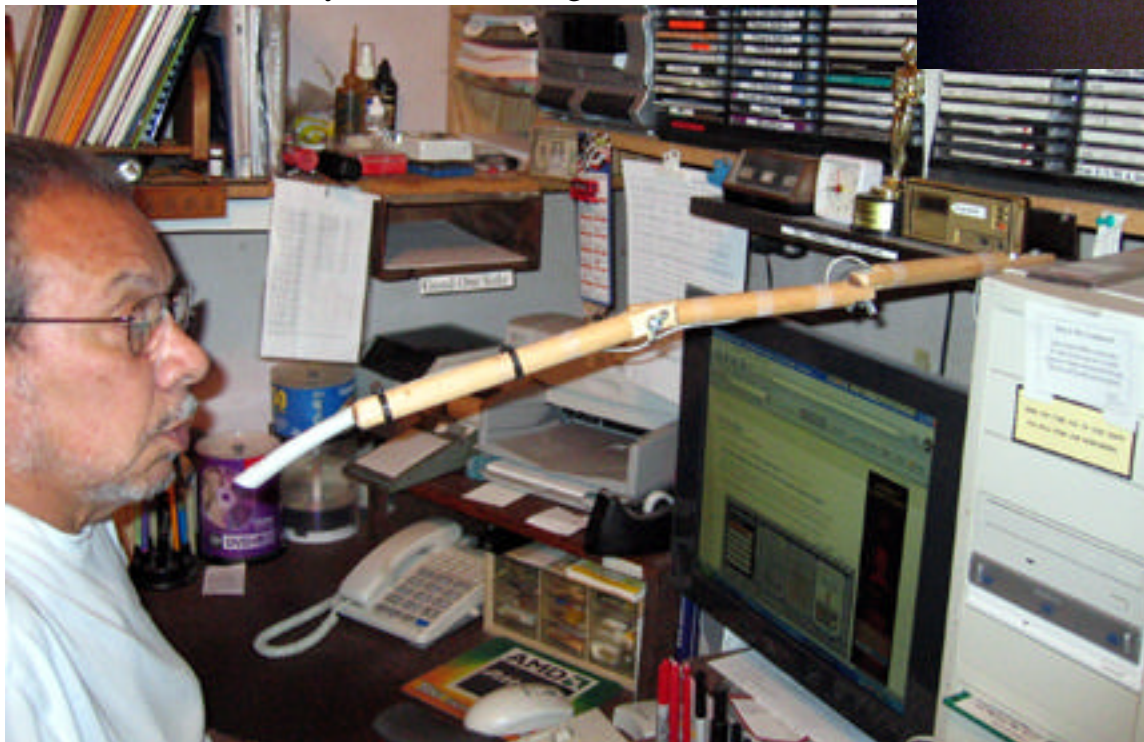
Works great when adding 'voice over' to movies.