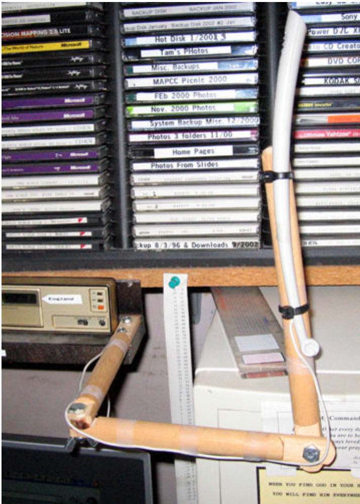
Handy adjustable microphone holder made of 1/2" wood dowel with wing nut adjustment joints. Fastened to wood shelf in front of me. Folds out of the way when not using it.